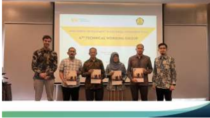
Group photo featuring Pondera, Bitu Bina Semesta (consortium member), MEMR and ETP representatives at the event.

The "Permitting and Regulation Assessment for Onshore Wind" report was handed over to the Directorate General of New, Renewable Energy and Energy Conservation (DJEBTKE) of the Ministry of Energy and Mineral Resources at the fourth Technical Working Group (TWG) Event, held recently. This report is a crucial part of the "Wind Energy Development in Indonesia: Investment Plan" project, led by