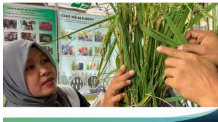
© Rural Youth Climate Action Movement (RYCAM) for Cool Farming - Silke Stöber - Research farmer from JAMTANI Pangandaran demonstrates at a fair in UNPAD how to breed rice varieties