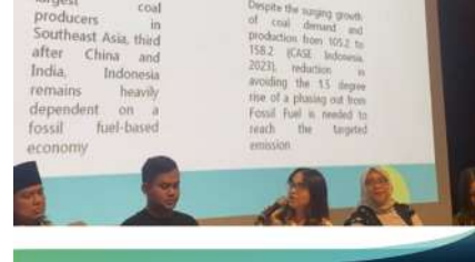
CASE Indonesia in Climate Witness National Dialogue

Women, often engaged in undocumented and unpaid labor, are more vulnerable during the transition to a non-fossil fuel-based economy. The CASE Project in Indonesia promotes a just energy transition narrative by fostering socio-economic resilience and breaking gender barriers through the development of new opportunities and roles for women post-transition in coal mining regions. Supported by the IKI JET project, CASE is studying the socio-economic impact on informal women workers in two coal mining regions, East Kalimantan and South Sumatera. At the Climate Witness event, CASE discussed this with key stakeholders, emphasizing the importance of inclusivity. Findings will be presented at the upcoming ISEW 2024.