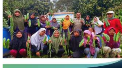
© Frankfurt Zoological Society - Nature Conservation Concessions - Members of the female farmer group in Sanglap present their vegetable harvest as a result of the field school training.

To increase household income, 60 female farmers from Sanglap, inside the Bukit Tigapuluh National Park, participated in a six-month field school training course. The training began with the planting of various vegetables as a fast-track activity and included the cultivation of lowland coffee, pepper, and vanilla. Due to high transportation costs during the rainy season, perishable fruits like oil palm can only be sold at very low prices. This issue can be mitigated in the future by processing storable products like Robusta coffee, pepper, and vanilla. As a first step, a local nursery was established to provide the necessary seedlings.