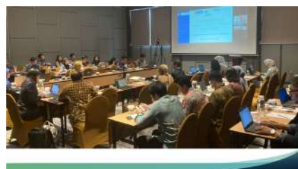
OECD/SIPA – 1st Technical Advisory Committee meeting: Framework for industry's net-zero transition in textile, iron, and steel sectors

The OECD is implementing "Framework for Industry's Net-Zero Transition" under the Sustainable Infrastructure Programme in Asia (SIPA). This framework is a step-by-step approach to assist emerging and developing economies in designing solutions for financing and to improve the enabling conditions that can accelerate industry's transition. In April 2024, the 1st Technical Advisory Committee meeting gathered