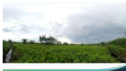
Peatland in Aceh, Indonesia

In Aceh, ASEAN REPEAT/SUPA has been supporting the provincial government and the two districts where pilot site activities are being implemented to develop their Peat Ecosystem Protection and Management Plan (RPPEG). On 26 April 2024, the RPPEG for Aceh Province was officially launched, marking Indonesia's continued commitment to promoting peatland protection.