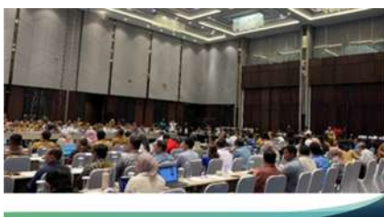
Public Consultation for Long-Term Development Plan RPJPD 2025 – 2045 in South Sumatra

ETP's support will boost energy security, lower electricity costs, and create jobs, aiding Indonesia's transition to a sustainable energy future.