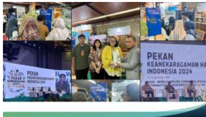
Participation on Biodiversity Week Organized by Ministry of Environment and Forestry (KLHK)

Adapting to the impacts of climate change