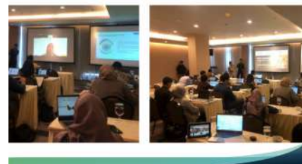
WWF Indonesia and Gadjah Mada University organised a capacity building event on nature-based solutions targeting representatives of provincial governments.

Written by Oki Hadian Hadadi, WWF Sustainable Infrastructure Project Leader in Indonesia, Sustainable Infrastructure Programme in Asia (SIPA). ohadian@wwf.id