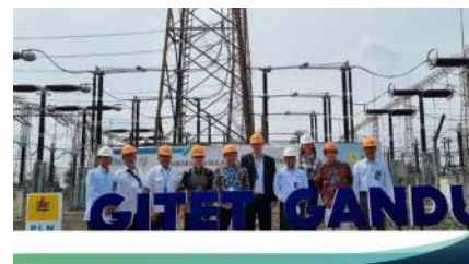
Powering Up for a Sustainable Future: The Southeast Asia Energy Transition Partnership's Support to Upgrade Indonesia's Largest Energy Generator

Written by Sheshadri Kottearachchi, Senior Communications Officer, Southeast, Asia Energy Transition Partnership, udanik@unops.org