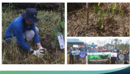
K-POP fandom communities participated in tree-planting activities in Hutan Harapan on February 9th, 2024, and IU fans and trees planted in the former forest and land fire area in Hutan Harapan

FZS and BKSDA Jambi are committed to re-establishing a viable orangutan population in the Bukit Tigapuluh landscape. The latest stars of the program are two young orangutans named after two Indonesian politicians: Siti and Sudin. Both orangutans were confiscated from illegal traders when they were around 1.5 years old. Since then, they have been trained daily to live like wild orangutans. After three years of training, they have mastered all the necessary skills to return to the wild. A total of 2,005 orangutans have been released in Bukit Tigapuluh, marking the halfway point to establishing a viable population.